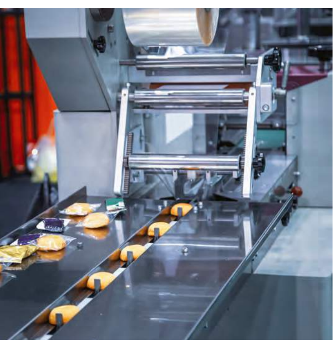
Cake Freshness by Aromatic solutions